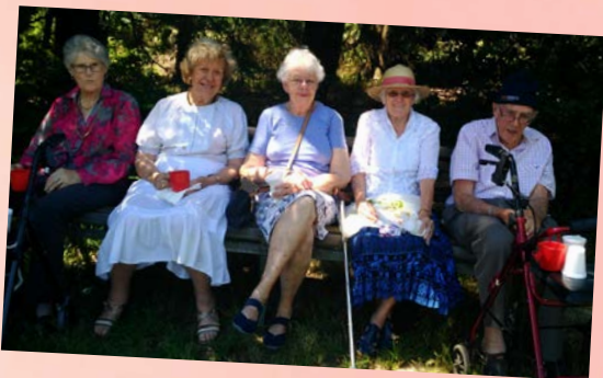
Famous Sheffield Pies for lunch