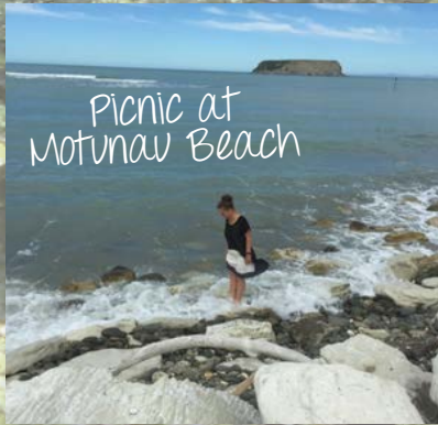
Picnic at Motunau Beach