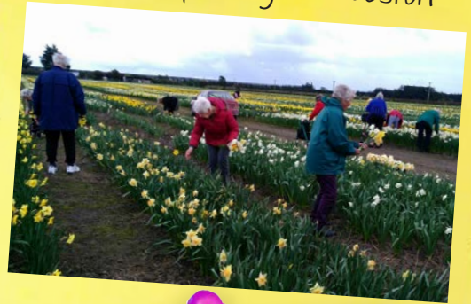
Daffodil picking at Leeston